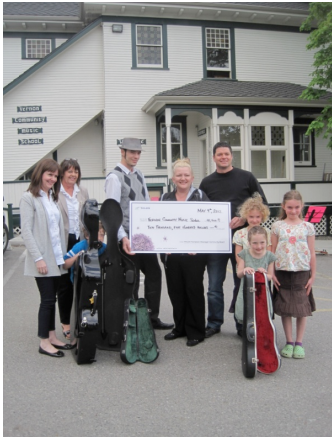
Telus Donates $10,500 to VCMS